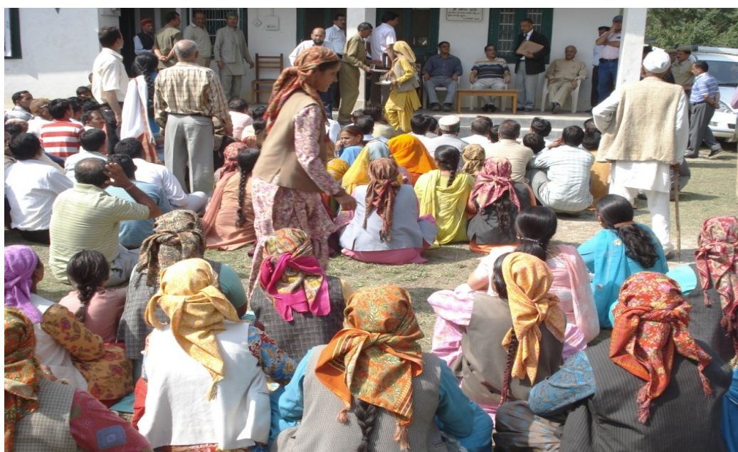
Illustration 9: Meeting at Bagshyad with NEAA chairman

Forest Officer to redesign the project in order to reduce the area of forest to be diverted. However, previous experiences across the country have shown that mining companies, after establishing themselves, expand their project size to cover wider areas and here too the locals believe that re-sizing of the project is an option that is unacceptable to them. Further the settlement of the community rights over these forests under the Forest Rights Act 2006 has yet to be initiated by the Himachal Government in this region. As per an advisory issued by the MoEF in July 2009, the final clearance for diversion of forest lands will not be considered unless there is full compliance with the provisions of the Forest Rights Act 2006. This includes an NOC from each of the affected 'gram sabhas' stating that their rights have been settled and they are in agreement of the project.