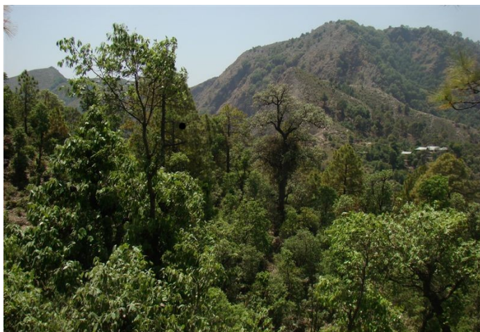
Illustration 4: Oak Forests of Jankhooni

livelihood. Wild Pomegranate trees also serve the same purpose as those on private lands with anardana selling at a whopping Rs. 350/- a kg. Mushrooms or Gucchi are also collected and provide a good income. The DPFs are also used for grazing of cattle and sheep. Similarly the