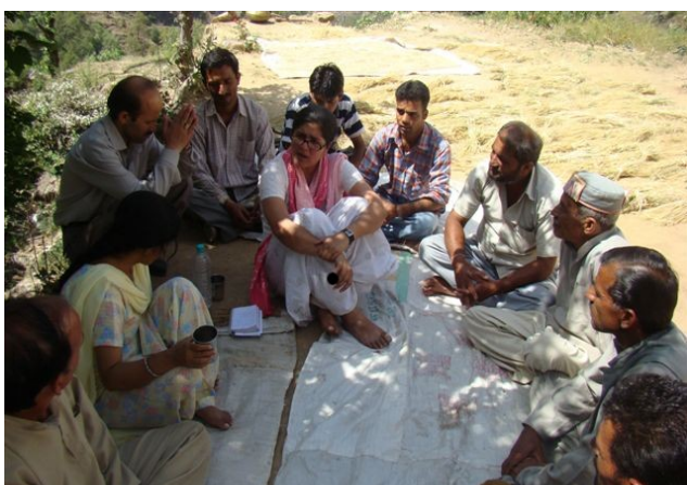
Illustration 3: Meeting at Bagshyad

The proposed mining area of 800 hectares is located beyond Alsindi, near village Shaungi and above village Talhain, across DPF Pheridhar, Alyas and Bagshyad. At least 7 villages depend on these rich forests for their everyday sustenance needs of fodder, fuel wood and grass. For those who own smaller land holdings, like Dalit communities, collection of NTFP from the DPF, UPF and RF areas is the main source of