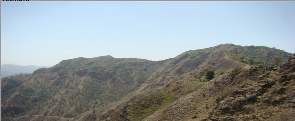
Illustration 5: Grass slopes at Talhain

If the cement plant comes up the conveyor belt would run from the Pheridhar ridge right over a small village called Talhain. Almost 60 families of the total 70 will have to part with approximately 664 bighas of agricultural land, almost 50% of the agricultural land in the village. Additionally 2000 bighas of DPF Talhain will also be diverted towards the mining. The DPF is a south facing grassy slope. The area fulfils the grass/fodder needs of the entire village, which has more than 1200 cattle. "Every family has cattle apart from goats and sheep which are openly grazed not only in the Talhain DPF but all the nearby forest areas" informs the Pradhan of the village. Moreover, it is the poor Dalit families who have smaller land holdings who own on an average 100 goats/sheep per family. Residents also perceive the threat of their natural water spring drying up as the upper slopes are blasted and mined for limestone. "We have 7 natural springs and 2 schemes of lift irrigation from the local nallah which will disappear as water sources dry up", add the Pradhan.