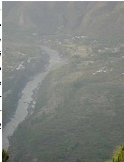
Illustration 7: Cement Plant Site adjacent to the Sutlej

The EIA mentions that water requirement for the project is more than 22 lakh litres per day which will be drawn from the nearby Satluj river. However, there is no discussion about the impacts of this on the downstream population, river fauna and ecology and the power projects which require a constant flow of water.