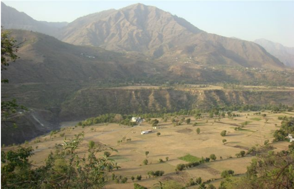
Illustration 2: FIELDS AT SHAKRORI - 500m FROM CEMENT PLANT SITE

vegetables like peas, cauliflower, cabbage, cucumber catering not only to the local market but upto markets in Delhi and Mumbai. Horticulture is practiced by almost every household with orchards and plantations of apple, pomegranate, walnut, plum, apricots and pears.