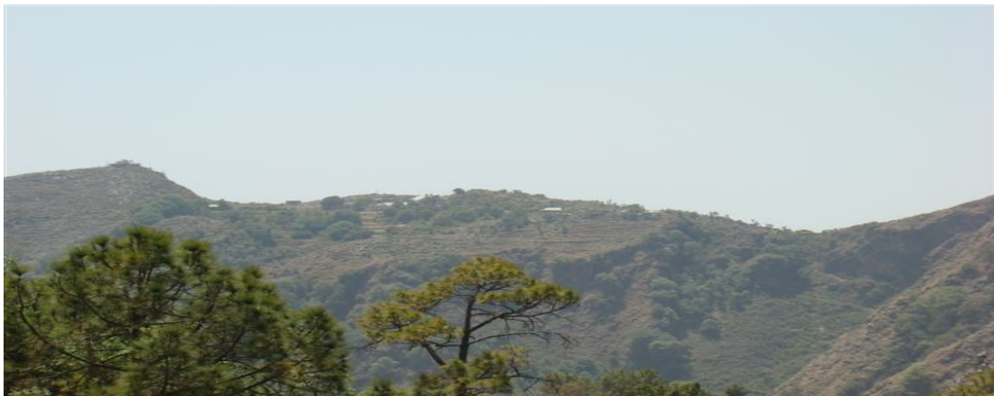
Illustration 6: Devbadeyogi temple on Pheridhar ridge

As described in the introduction, the forests around the mining area are rich in floral and faunal diversity comprising of wildlife like leopards, black bear, goral , barking deer, peacocks and various other endangered pheasant species. The locals believe that these rich oak and deodar forests are home and territory of the local deity called Deo Badeyogi, and hold enormous cultural significance across 8 Panchayats. The temple of the deity is situated on the ridge of the proposed mining area.