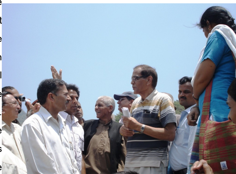
Illustration 8: Chairman of NEAA during site visit

The Forest Clearance for diversion of forest lands under the Forest Conservation Act, 1980 is still pending with the state government. Apparently, the company has attempted with the help of the Divisional